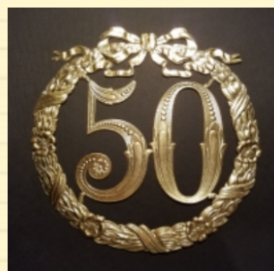
This 50th anniversary decoration is from 1969.